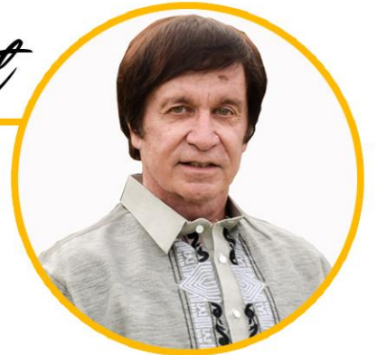
DIR. GREG KONKE

I have been strongly encouraged regarding the sincerity, openness and sharing of the various Rotary clubs I met at DTTS/PETS/SETS in Butuan.